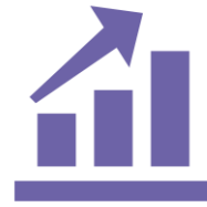
Marketing, Sales, and Service