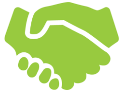
Business, Management, and Administration