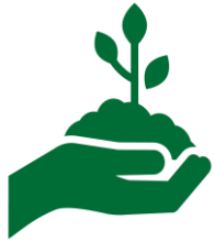
Agriculture, Food, and Natural Resources