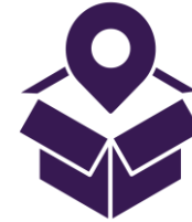
Transportation, Distribution, and Logistics