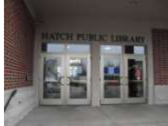
Hatch Public Library, Mauston COLAND Meeting, July 2014

Public libraries continue to serve as repositories of knowledge in the 21st century while methods of delivery have shifted to electronic