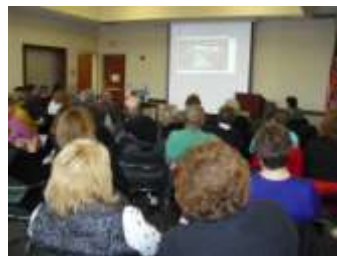
Hatch Public Library, Mauston Library Trends in the 21 st Century

For most Wisconsin communities the public library is the primary place for access to digital resources, high speed networks, gathering places and promotion of local cultural assets