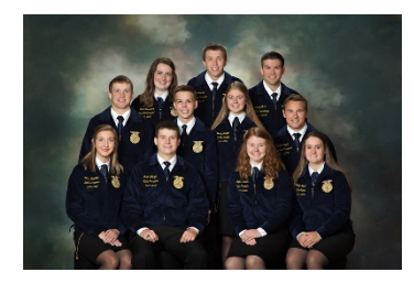
FFA 252 Chapters 20,825 Members