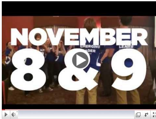
Emerging Leaders Conference Promo

Click link to see more Wisconsin DECA resources and pictures