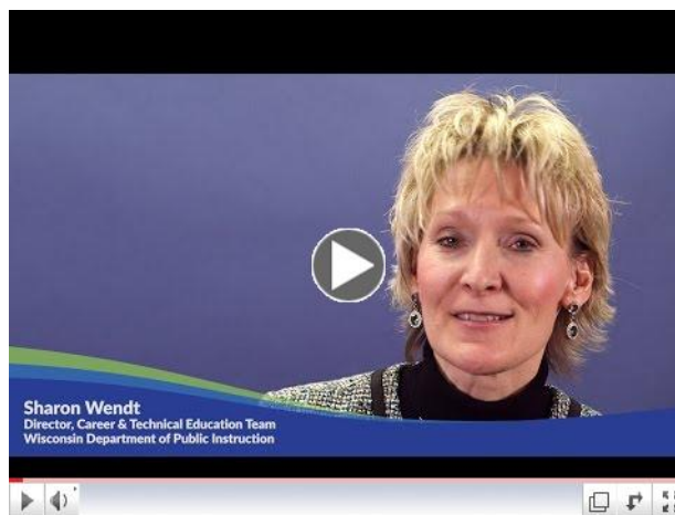
CTE Winter 2016-17 Update

Finally, please check out our latest video update for "What's new in CTE" and we wish you the best for a great year!