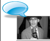
D.I.Y. Old-Time Radio - Grades 3- 12. Interactive site