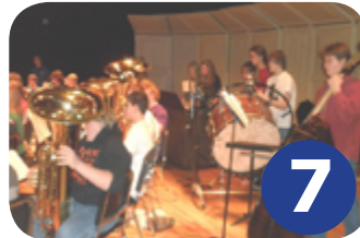
Hayward, Rice Lake, Cumberland, Bloomer, Barron, Chetek-Weyerhaeuser School Districts, Honor Band