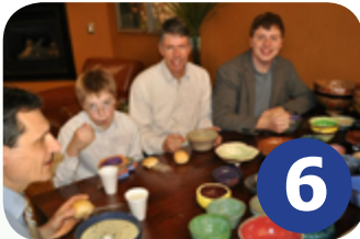
Ripon School District, Souper Bowls Project