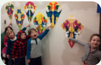
Wisconsin School for the Deaf, Delavan, Art Students