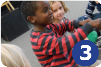
LaCrosse School District, Theatre Activities