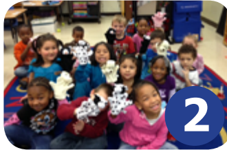
Beloit School District, Integrated Music Unit