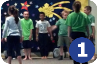
Janesville School District, Integrated Dance Unit

Examples of arts programs by congressional district.