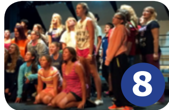
Door County Show Choir Camp, Sturgeon Bay