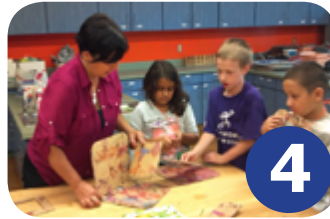
Milwaukee Public Schools, Art Class