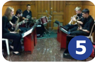
Waukesha School District, Jazz Quintet Performance