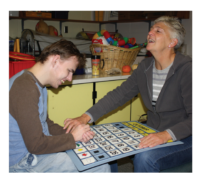
The UW-Platteville TVI program is fully accredited.

The graduate tuition rate for this program is $450 per graduate credit hour for Wisconsin, Iowa, and Illinois residents.