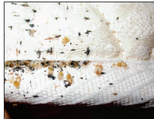
Bed Bugs and fecal blood stains on a mattress.