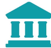
Government and Public Administration