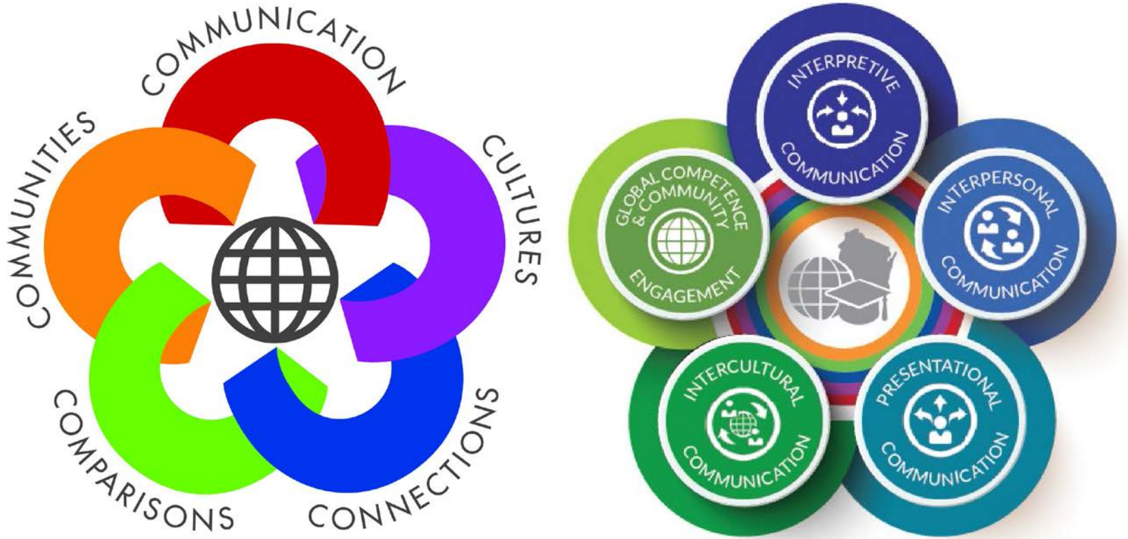
Figure 1. National World-readiness Standards for World Languages and the Wisconsin Standards for World Languages (adapted from The National Standards Collaborative Board, 2015, p. 28).

These Wisconsin Standards for World Languages leverage the strengths of the national standards and aligned resources within a framework that heightens attention to helping students discover their voice, perspective, and agency within linguistically and culturally diverse local, and global communities. Critical components of this development include using the language to compare languages and cultures, learn through and about other disciplines, and to engage in respectful and successful intercultural relationships. Standards-based world language programs prepare students for lifelong learning, professional opportunities, and full participation in the interdependent and multilingual communities locally, and around the world.